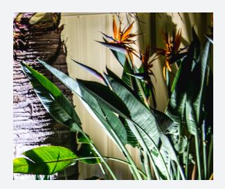
Spotlights: Great for illuminating individual plants or trees and turning them into a garden feature.