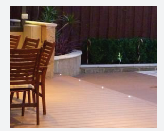
Deck Lights: Light up the perimeter of your deck to enhance your outdoor entertaining area.