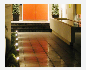
Path Lights: Create a statement entrance to your home by lighting pathways around your front door.